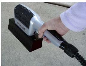
3” UVwand (1200 W)

Min-eLux™ Equipment: Patent-pending UV technology that offers maximum portability, ease of use, increased efficiency, and instant On-Off capability. Currently three portable systems are available: 3” UVwand , the 8” UVsabre , and the FX-1U floor machine with 15” UVsword .