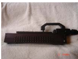
8” UVsabre (1600 W)