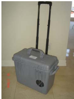
Carrying case for UVwand and UVsabre