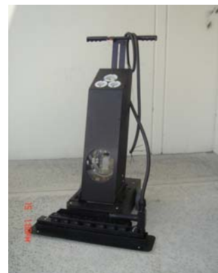
Portable Upright model: FX-1U with 15” UVsword (3500 W)